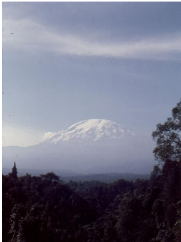
Early 1970s 40 years later